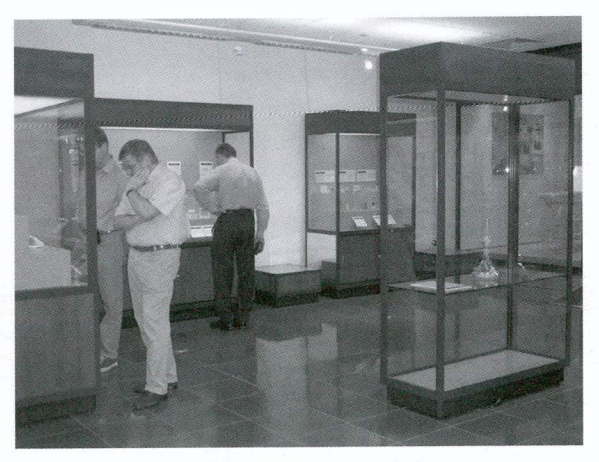
Representatives from the ISO Standards Committee 6 enjoying the Museum displays.